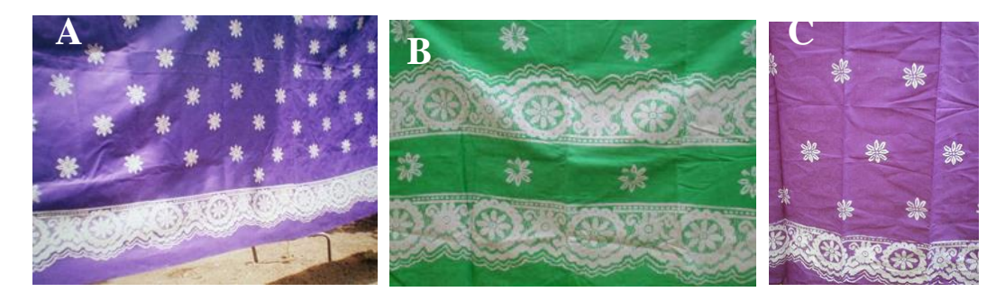
Fig., 8A, B & C: Resultant products of some completed discharge prints