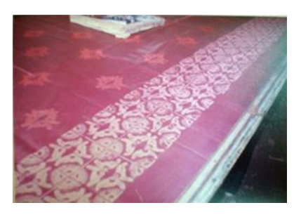
Fig., 7: Effect of aeration as printing was in progress