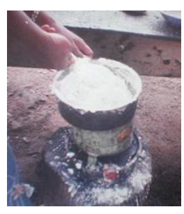
Fig., 3: Preparation

The effectiveness of the discharged print paste, its application onto the sheda fabric was done within 40 minutes of its preparation (Fig., 3).