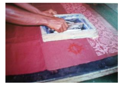
Fig., 6: Applying the prepared discharge printing paste