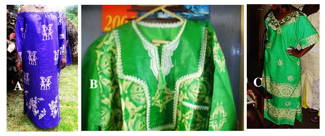
Fig., 10A: Discharge print fabric turned into a fashionable attire

Fig., 9A, B & C: Discharge print fabrics integrated with plain fabrics turned into fashionable attires