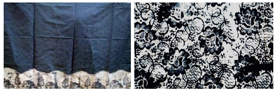
Fig., 13: Discharge effect produced only at the edge of the fabric with lace material

The same processes were followed as stated in experiment one, but the exception in the discharge paste application was the use of lace fabric over the face of the dischargeable fabric. All the experiments conducted used the locally prepared discharge print paste successfully to produce excellent results in the production of a fashionable attire.