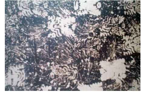
Fig., 12: Discharge effect produced by block stamping with discharge liquid

designed block substrate. Others common to all the projects have been enumerated in experiment I. In this experiment, the mixing of the discharge solution, the preparation of the discharge paste was the same as in experiment I. The printing device for the application of the discharge paste however, was the wooden block instead of the hand screen.