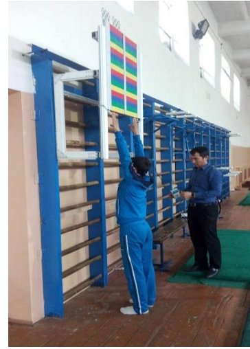
picture-1 Device "SPORK" for measurement of ability of explosive actions.