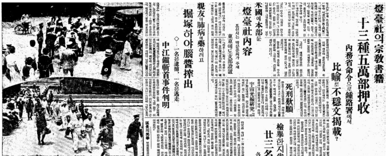
Image II: Newspaper clipping from 1938 reporting the Deungdaesa Incident and showing images of arrest.