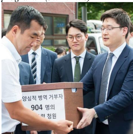
Image V : Lawyer submits Conscientious Objection Appeal

"On August 11, 2017, a delegation representing 904 conscientious objectors submitted a petition to the new president, asking that the government recognize the right to conscientious objection by releasing those imprisoned and implementing an alternative civilian service program." (JW NEWS)