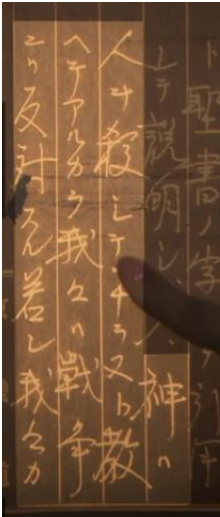
Primary Source: Japanese Occupation Era, Jehovah's Witness prisoner statement: "Due to the Bible teaching, 'thou shalt not kill' we are opposed to involvement in this war".